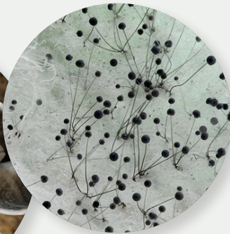
Black mould spores