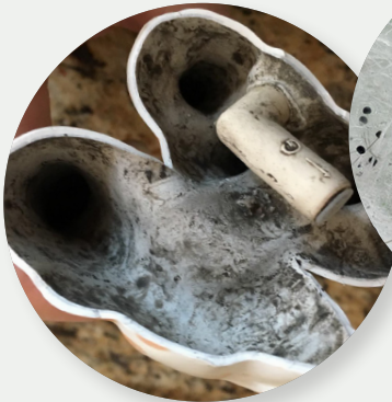
A dissected squeaker teether reveals hidden mould flourishing inside

Although undetectable from the outside, dense growths of black yeast and fungus were detected on the inner surface of 4 out of 5 of the toys tested. A staggering 80% tested positive for "potentially pathogenic bacteria", linked to hospital acquired infections.